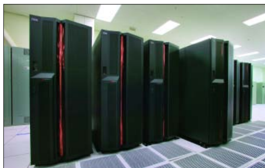
Figure 3. Bassi, named for 18th century Italian professor Laura Bassi, is an IBM POWER 5 system with 888 processors. The system has a theoretical peak performance of 7.4 teraflop/s and 100 terabytes of disk space.