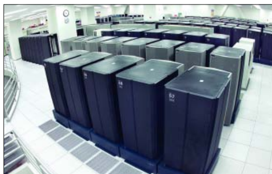
Figure 4. Seaborg, named in honor of LBNL Nobel Laureate Glenn Seaborg, is a 6,756-processor IBM supercomputer. Scheduled to be retired in 2008, Seaborg has a theoretical peak speed of 10 teraflop/s.

visualization, and analysis—coupled with the activities necessary to engage vendors in addressing the DOE computational science requirements in their future roadmaps. Science-Driven Services are the entire range of support activities, from high-quality operations and user services to direct scientific support, that enable a broad range of scientists to effectively use NERSC systems in their research. NERSC concentrates on resources needed to realize the