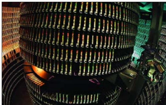
Figure 5. The High Performance Storage System (HPSS) at NERSC.

This strategy has guided NERSC's procurement of large computing systems, in particular the newest machine, Franklin, a 19,496-processor Cray XT4 supercomputer (figure 1, p36). The system will deliver sustained performance of at least 16 trillion calculations per second—with a theoretical peak speed of more than 100 teraflop/s—when running a suite of diverse scientific applications at scale. The system will have over 400 terabytes of high-performance, parallel disk space. Initial installation began in 2006 and the full system is scheduled to go into production service in late summer 2007.