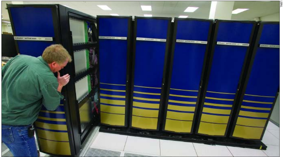
Figure 1. Franklin, named in honor of America's first scientist Benjamin Franklin, is a 19,496-processor Cray XT4.