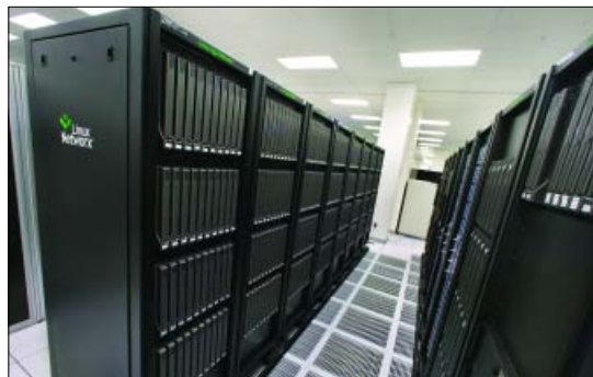
Figure 6. Jacquard is a 740-CPU Linux Network cluster running a Linux operating system. Theoretical peak speed for the system is 3.1 teraflop/s. The machine is named in honor of inventor Joseph Marie Jacquard, whose loom was the first programmable machine, using punch cards to control a sequence of operations.

Because of the high demand for computing resources from SciDAC investigators and other researchers, NERSC has developed a three-part strategy to ensure that its systems and services ensure the highest level of scientific productivity.