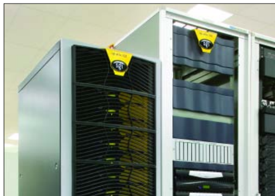
Figure 7. DaVinci is named after the famous Italian artist and scientist Leonardo da Vinci, due to its intended combination of visual imagery of technical information.

those files. Alternatively, when sharing data between machines, NGF eliminates the need to copy large datasets from one machine to another. Because NGF has a single unified namespace for all systems, a user can run a highly parallel simulation on the 6,000-processor IBM SP (Seaborg), followed by a serial or modestly parallel post-processing step on the Linux Network cluster (Jacquard), and then perform a data analysis or visualization step on the SGI visualization cluster (DaVinci)—all without having to explicitly move a single data file.